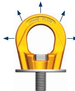
Loadable in all directions