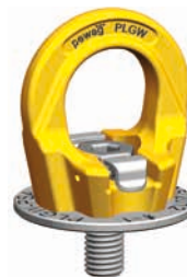
PLGW-PSA supreme for tool-free assembly

Every anchorage point is marked with the thread length and the permitted number of persons. The individual serial number enables complete documentation on all compulsory inspections.