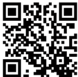
Mounting video PLGW supreme

You can find more information on the functionality either by watching the video on our homepage ( www.pewag.com ) or by reading the operating instructions.